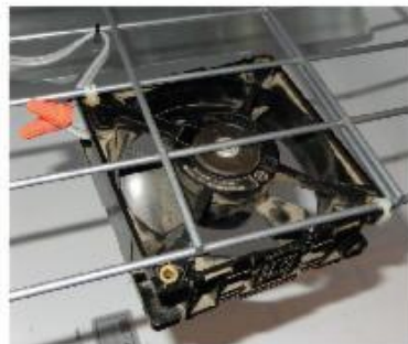
A fan is mounted underneath the wire shelf.

A greenhouse thermostat with a remote sensor monitors and