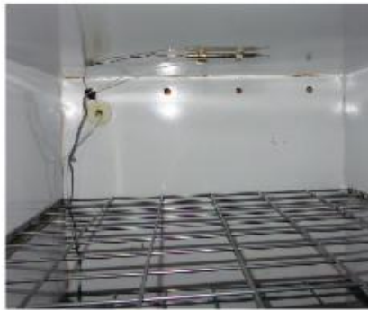
The sensor for the greenhouse controller is mounted to the ceiling inside the kiln. The four holes drilled through the upper back wall of the freezer can be seen.

percent, so the air exiting the kiln often condenses on the outside of the holes. As the drying process progresses, the humidity continues to drop. The time it takes for the blanks to finish drying depends upon: the time of year the tree was cut, wood species, diameter, rough-turned wall thickness, stor-