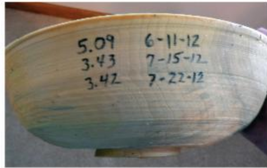
A 13" (33cm) cottonwood bowl, rough turned from green wood, weighed 5.09 lb (2.3kg) June 11 when it was placed in the kiln. It weighed 3.43 lb (1.6kg) July 15, and 3.42 lb (1.6kg) July 22. This bowl stopped losing weight, is dry, and ready to be finish turned.

age-environment temperature, and humidity.