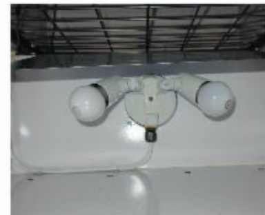
The lightbulbs are mounted on the back of the kiln near the bottom, a sheet of metal covers the bulbs, and the holes are drilled through the bottom of the freezer.

After my first batch of wood was dry, I decided to install a 5" (13cm) fan, salvaged from computer equipment. This fan runs all the time and helps circulate the air, which speeds up the drying process. Without the fan, the first batch of wood took approximately seven weeks to dry. The second batch took only five weeks.