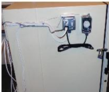
Mounted on the left-hand side of the kiln are the controls, power switch, and outlet, as well as the greenhouse controller. Note the padlock for safety.

A small chest freezer that had quit working began the project. The metal walls with insulation between them help retain heat, making this kiln economical to run, even in wintertime. For safety, I installed a hasp and padlock on the door.