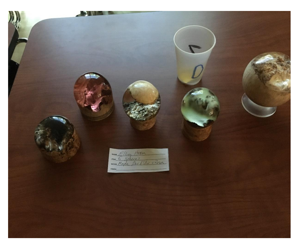
Gallery of Talent on Display. Winner receives a gift certificate to Craft Supply