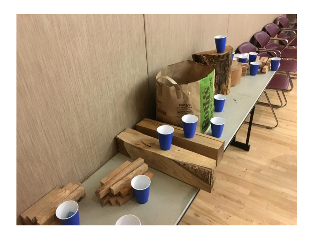
Raffle table - generosity of members in support of club activities and opportunity to pick up some excellent material for turning. Thanks to all contributors.