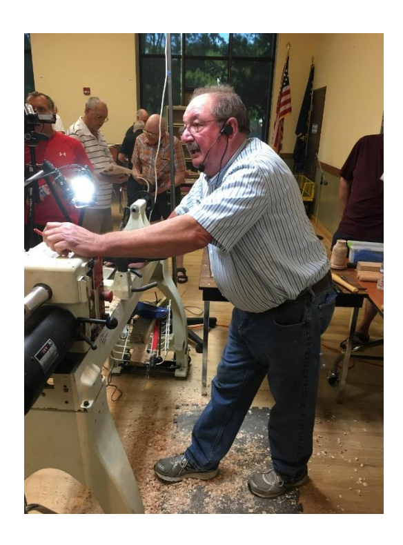
Taking time to make a point and answer questions!