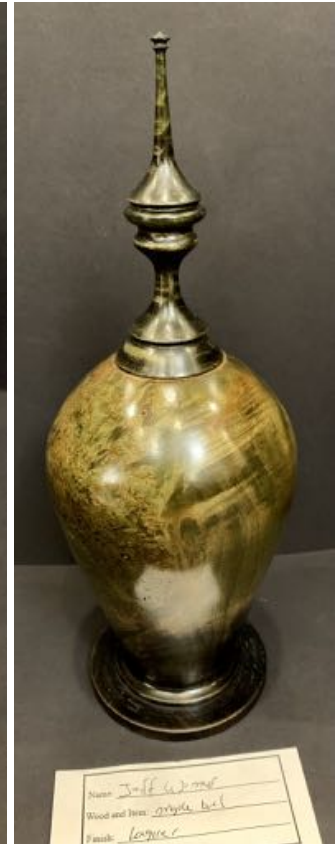
Name Jeff Wood Wood and Inl: maple burl Finish Lengua