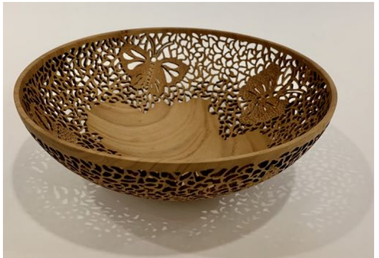
Some of Kathleen's pieces.