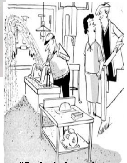
“So far he’s made two things: sawdust and noise.”