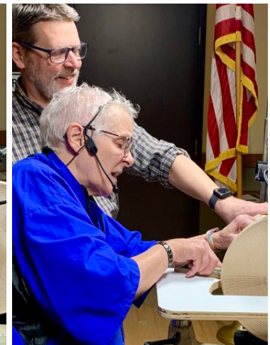
Above: the platform in use